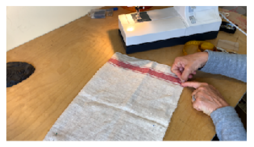
Sew the 2 open sides together: You might like to pin your folded fabric in place to prevent shifting. Then, using a .5" seam allowance, sew one short side and the long side together with a straight stitch. NOTE: only sew the long side to about 2.5" from the top. Leave the rest open.

Keep the cut sides from fraying : Using a overlocker or zig-zag stitch, finish all cut sides. Hem one short side (if using fabric by the yard): If you're using fabric by the yard, fold over the fabric once or twice and sew the hem.