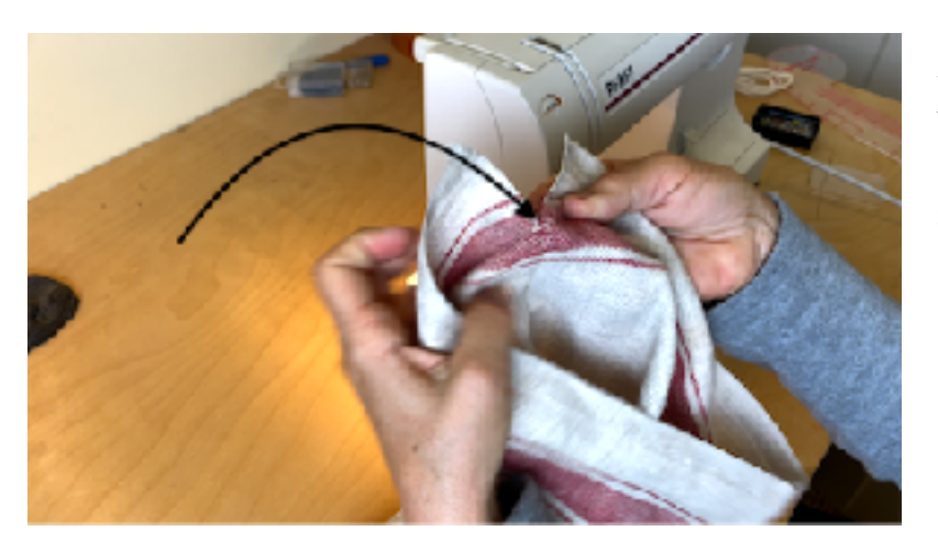
Secure this seam: Sew a few times back and forth perpendicular to the seam to secure it.

Press the seam: Either use your fingers or a hot iron, press the seam on the long side open.