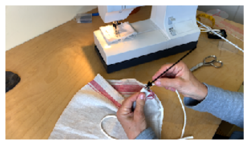
Guide the drawstring through the tunnel: Put a safety pin through one end of your cord and move it all the way through the tunnel. Secure the ends with a knot.

How to make your own drawstring: you can use some thick yarn and crochet a long string. Notes